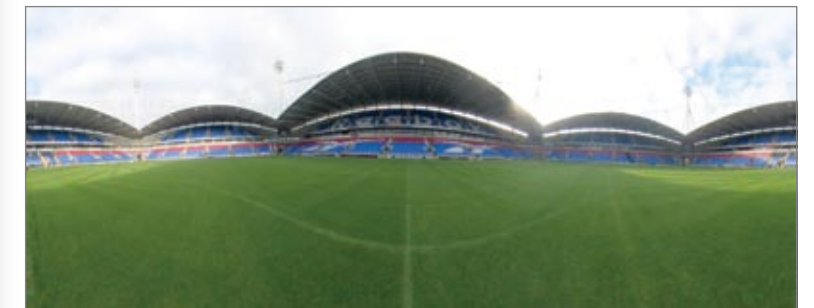
Bolton Wanderers Football Club - Centre of pitch

let us visit your corporate venue and take all the hassle out of panoramic photography for all your corporate literature and printing needs