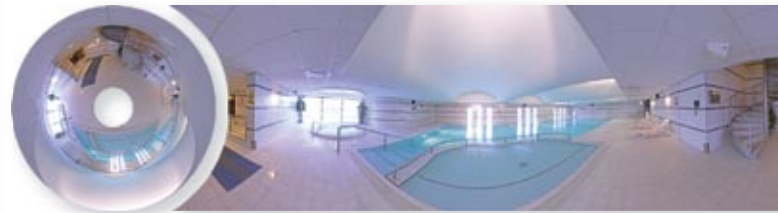
The raw "doughnut" image on the left is processed into the 360 degree image on the right - no more stitching!

Indeed, one of the key marketing points for the Virtual360 solution is that it is a complete solution. Once one agrees to take this service on, a lens is loaned and the agent just starts clicking away. There's no need to buy anything else or invest in anything. It cannot be any simpler.